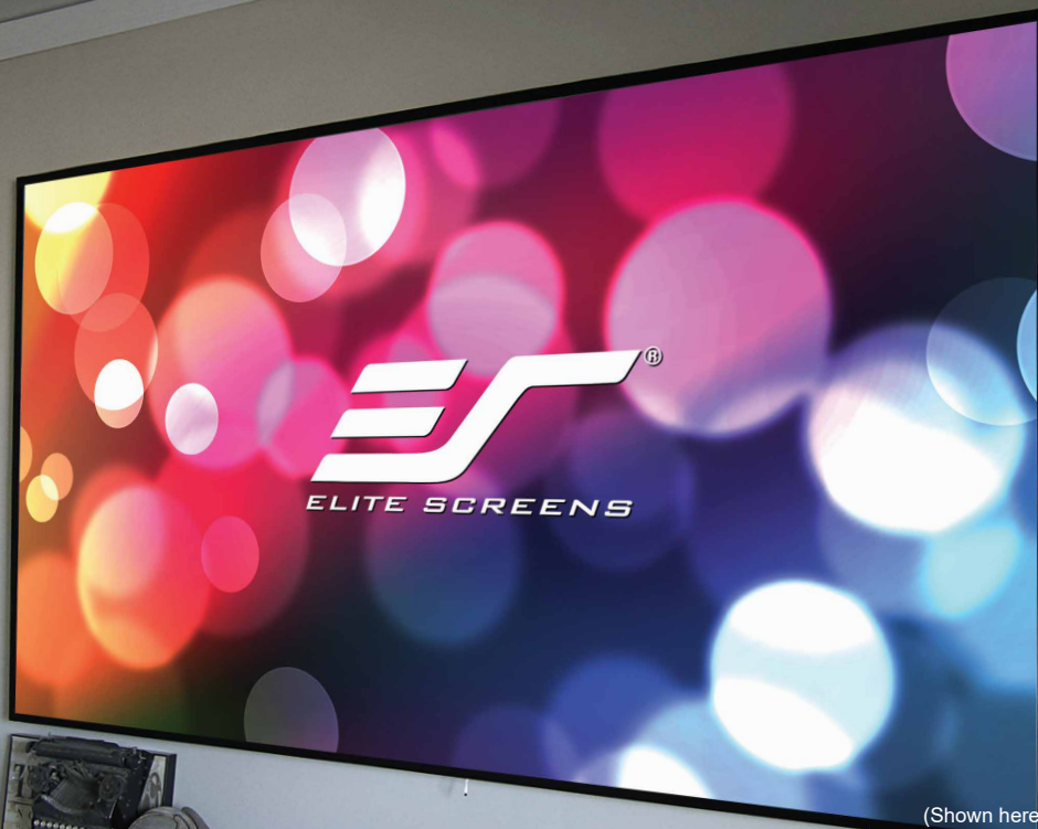
(Shown here on Aeon EDGE FREE® Screen)

The CineGrey 3D® is a reference quality front projection screen material formulated for environments with minimal control over room lighting. It was designed to enhance picture brightness, offer accurate color fidelity, and improve contrast levels. The CineGrey 3D® is best for family rooms, educational facilities, conference rooms or any applications in which incident light is a factor. Typical matte white surfaces wash out the images when ambient light cannot be controlled. The CineGrey 3D® is the best choice for having a projected image with a balanced color temperature and contrast under such conditions. It provides flat spectral response for an accurate color balance in dark room environments as well for reference quality applications. The CineGrey 3D® is ready for the next-generation of high-performance video.