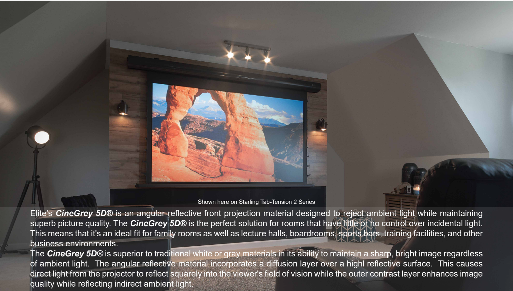
Shown here on Starling Tab-Tension 2 Series

Elite's CineGrey 5D® is an angular-reflective front projection material designed to reject ambient light while maintaining superb picture quality. The CineGrey 5D® is the perfect solution for rooms that have little or no control over incidental light. This means that it's an ideal fit for family rooms as well as lecture halls, boardrooms, sports bars, training facilities, and other business environments.